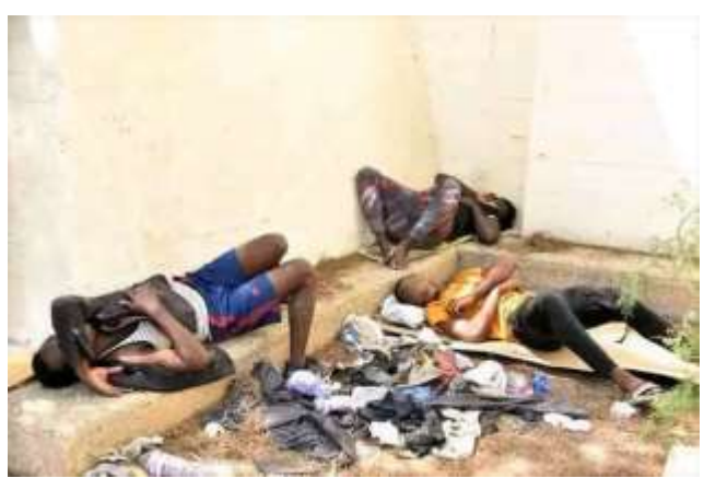
People arrested in Zarzis and deported to the desert. Photo sent by people who got deported

Today, at 8:56 CEST, Alarm Phone received the following message from someone who had been deported into the desert by Tunisian forces: "We are not well. We were attacked by armed soldiers. The Libyan forces shot at us, beat us up, and raped the women during the night. I am running out of battery."